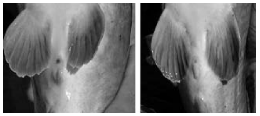
Figure 1. The genital papilla region of the female (left) and the male (right) channel catfish. The female's region is slit shaped compared to the fleshy nipple appearance of the male.

Mature fish have secondary sexual characteristics that are also useful for selection. These characteristics are most evident near spawning time. The male has a broad, muscular head wider than the body, thickened lips, and often a gravish mottling on the underside of the jaw and abdomen (Fig. 2). The female's head is narrower than the body and she usually lacks the muscularization and pigmentation common in males. During the spawning season, a sexually mature female will have a well-rounded abdomen that