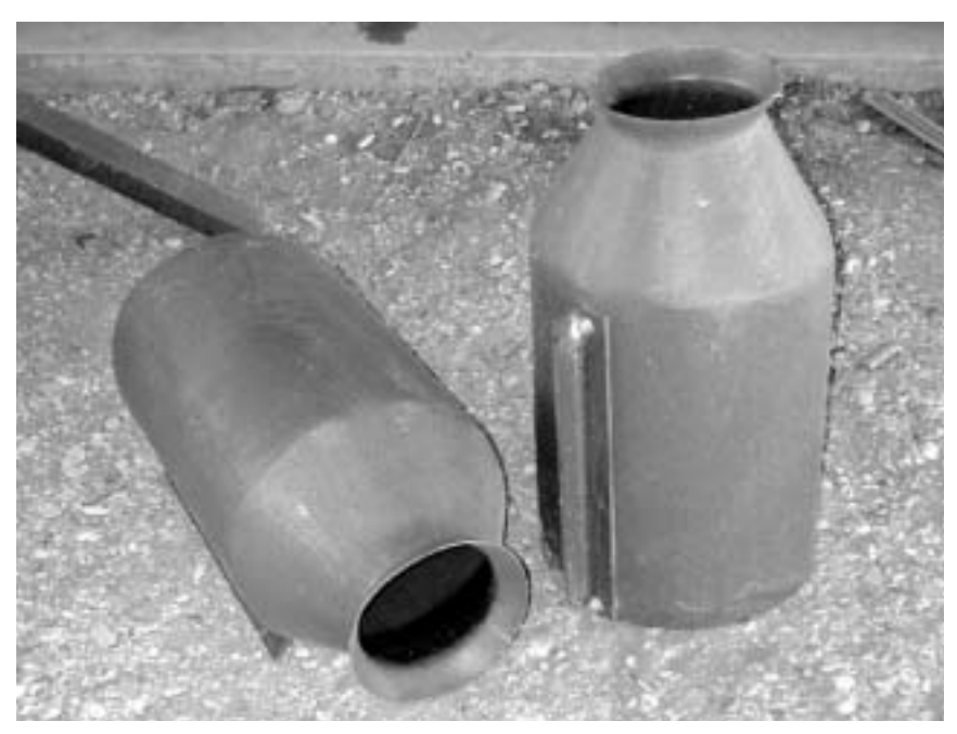
Figure 3. These plastic spawning cans, shaped like milk cans, are used in channel catfish culture.

containers have an internal volume of 20 gallons and an opening of 6 to 9 inches across. Spawning containers are not placed in the pond until the water temperature reaches 75 °F. The channel catfish spawning season in the U.S. can begin in early April and last until mid-July. The length of the season and the start of the season depend on water temperature. Once water temperature has reached 70 °F and remains at that temperature for at least 3 consecutive days, spawning begins. In the southern U.S. spawning season usually begins in late April; in the northern U.S. it does not begin until mid-May.